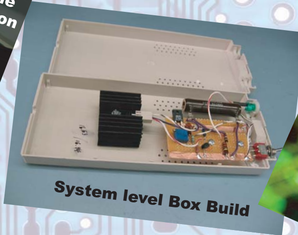
System level Box Build