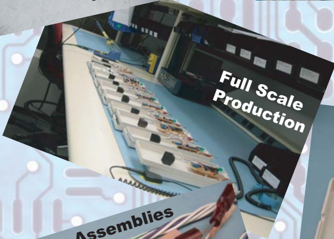
Full Scale Production

QUALITY PRODUCTS CONTROLLED PROCESSES EFFICIENT PRODUCTION